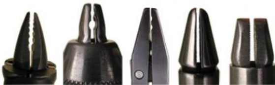
Vice jaw types