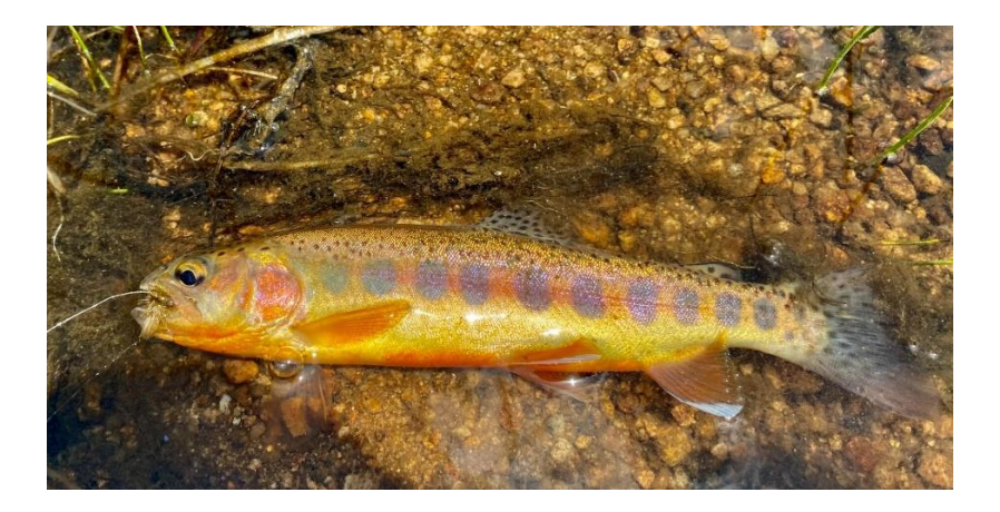
California Golden Trout

Was I fly fishing, or was I not? Yeah, I know. I was bait-casting with a dead animal, nothing more than the much-maligned meat fisherman. Now, however, I figured that if a fellow had a proper fly line threaded down the ferrules of a willowy fly rod, and he knew how to smoothly roll out that line with the