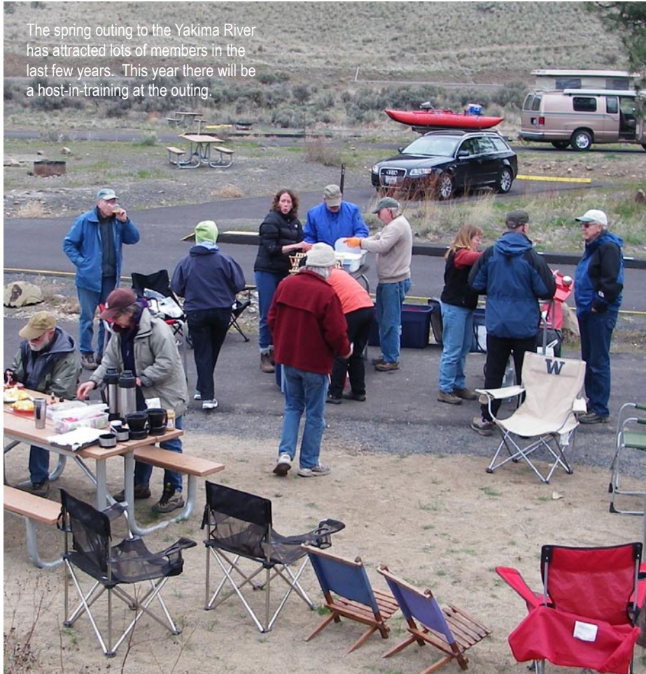
The spring outing to the Yakima River has attracted lots of members in the last few years. This year there will be a host-in-training at the outing.