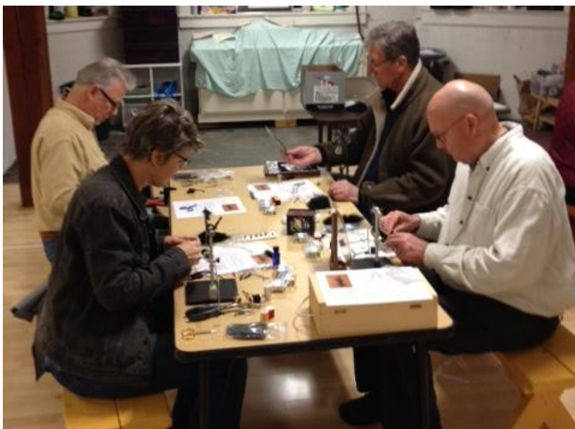
Fly tying at bench. Wooley buggers ready to go!